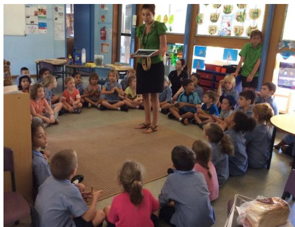
During Buddy Class we learnt about the Last Supper with 2/3