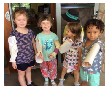
We wanted to be just like our friend!