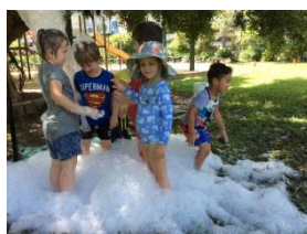
It's a foam party!!